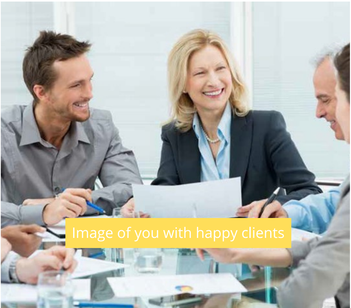
Image of you with happy clients

You probably won't be surprised to learn that we hear from a lot of businesses who are unhappy with their current IT support provider.